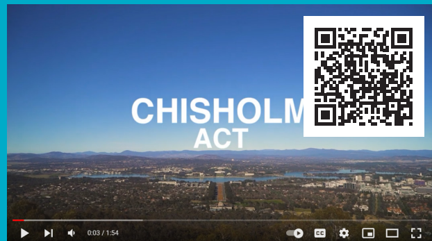
Capital Chemist Chisholm Guild Pharmacy of the Year, 2020